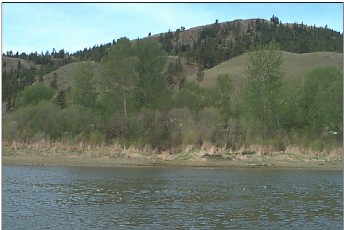
RIGHT BANK VIEW