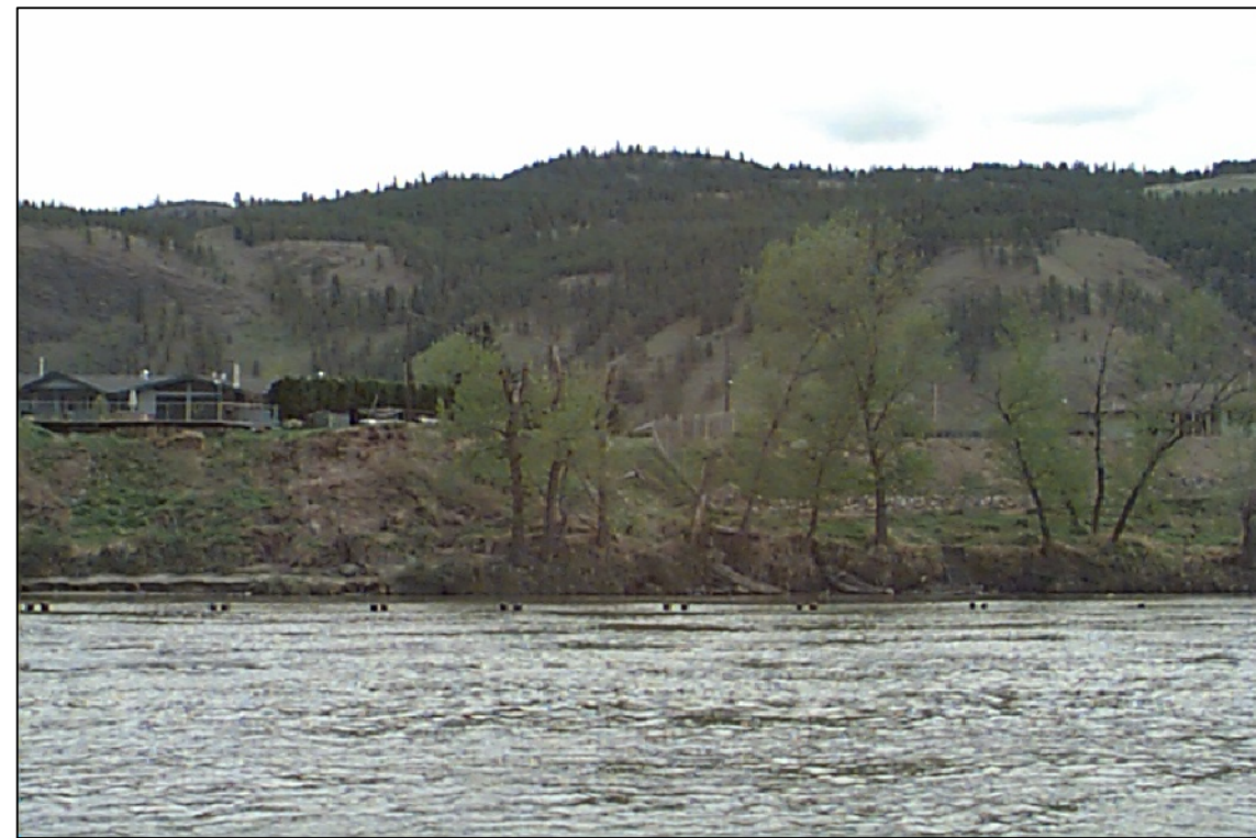
LEFT BANK VIEW